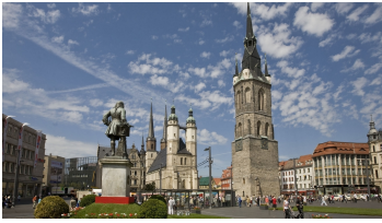
Market square w. Red Tower