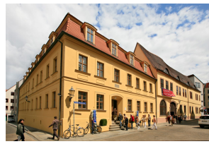
G.F. Haendel's birth place